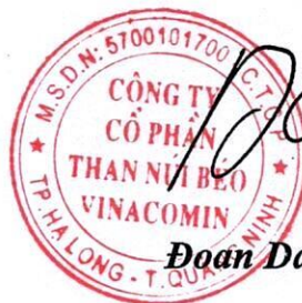
Đoàn Dac Tho