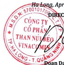
Đoàn Đức Thọ